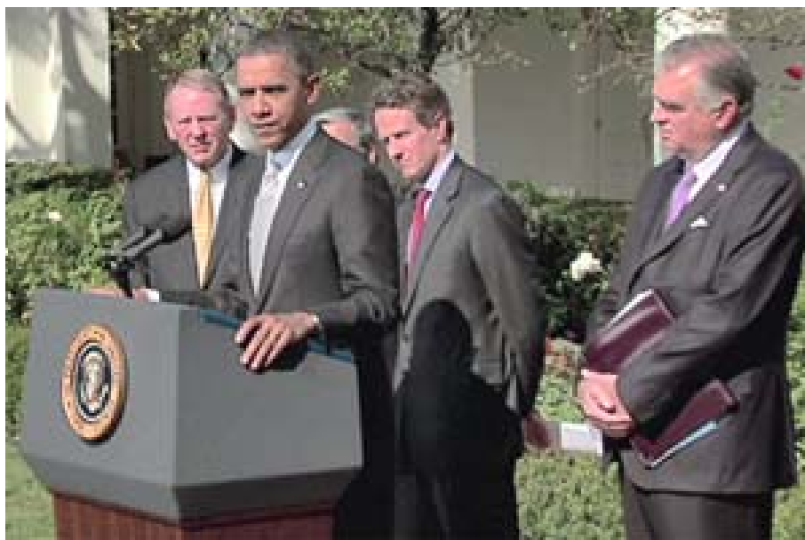
President Obama signing the extension of the SAFETEA-LU transportation bill.

It is, of course, hoped that by the September 30, 2009 deadline a new transportation bill could be passed. There is a plan that has been drafted for the new bill but it remains unknown if it will be passed by the end of the latest extension.